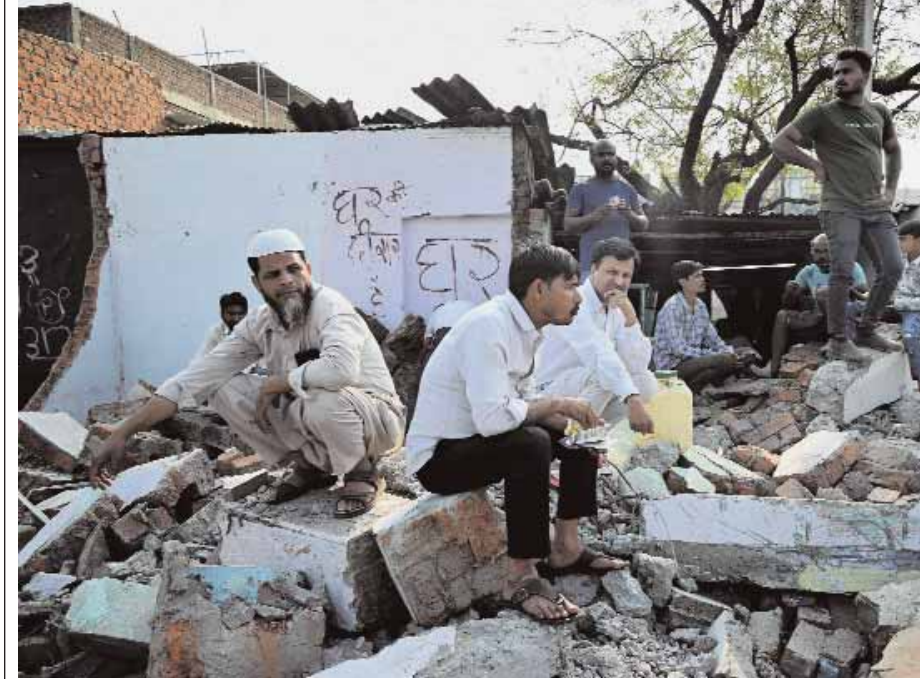
BMC employees demolished houses and shops to clear the venue following the order of the district administration for the expansion of railway track at Motinagar, old subhash nagar locality in Bhopal on Sunday.

Accreditation deadline for pvt schools extended