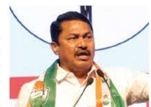
Fadnavis and deputy chief ministers Eknath Shinde and Ajit Pawar. "Whether it was the Fadnavis government from 2014 to 2019, the subsequent Shinde-Fadnavis

Agencies Mumbai, February 5 As Dhananjay Munde continued to face multiple charges, the Congress on Wednesday mounted a major offensive against the BJP-led Maha Yuti-NDA government saying that the entire government is corrupt, not just the NCP minister. The Congress also slammed chief minister Devendra